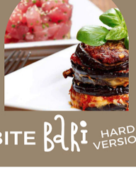
BITE Bari HARD VERSION