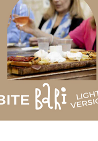
BITE Bari LIGHT VERSION