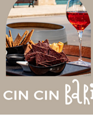
CIN CIN Bari